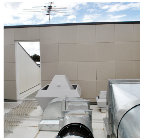
Cooling towers and HVAC