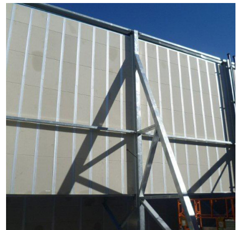
Outdoor areas - including Power generators, air conditioning enclosures